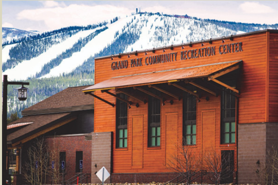
Fraser Recreation Center