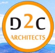
Grand County EMS