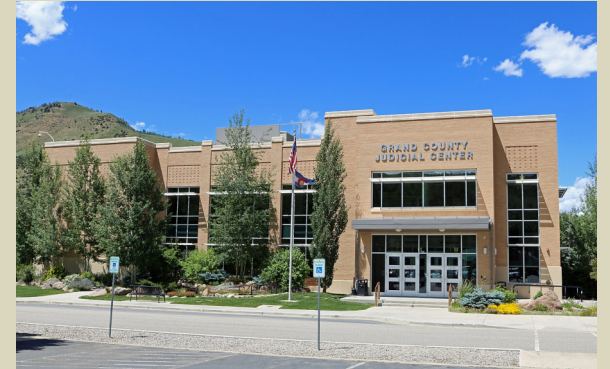
Grand County Judicial Center