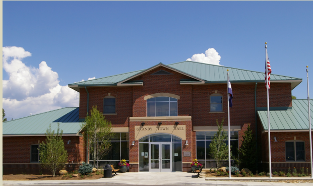
Granby Town Hall