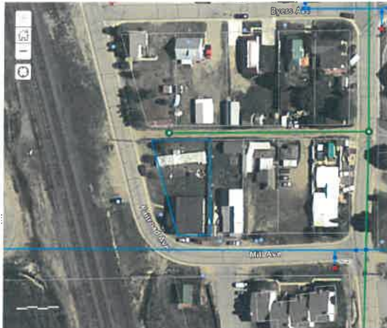
Parcels (Features: 1786, Selected: 1)